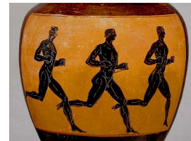
Circa 332-333 BC