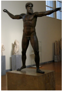
Bronze Statue of Zeus c. 460 BC

According to myths, Zeus - the father of humanity - fought, wrestled, and defeated Kronos in a struggle for the throne of the gods.