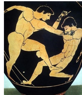
Greek amphora painting, c. 500 B.C.