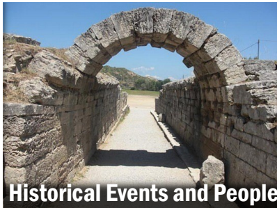
Historical Events and People

The first ancient Olympic games can be traced back to 776 BC.