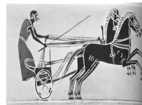
Chariot Race 6th Century BC